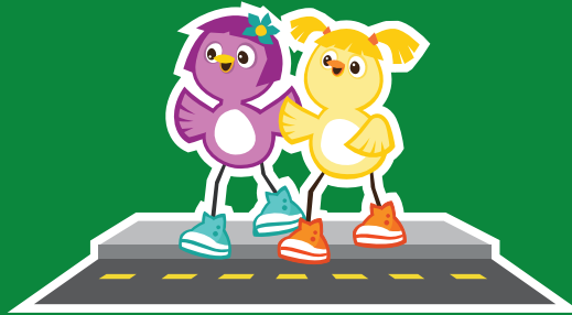
ON TRAVERSE LA RUE (WE CROSS THE STREET)