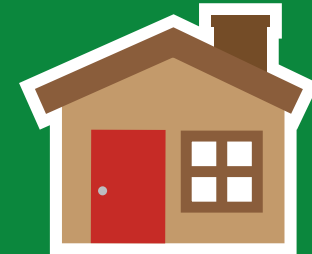
小木屋 Xiǎo mù wū (HOME)