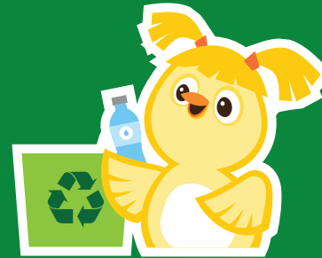
回收 HÚI SHOU (RECYCLE)