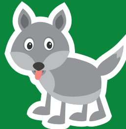
狼 Láng (WOLF)