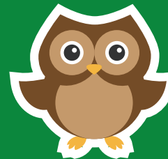
貓頭鷹 Māo Tóu Yīng (OWL)