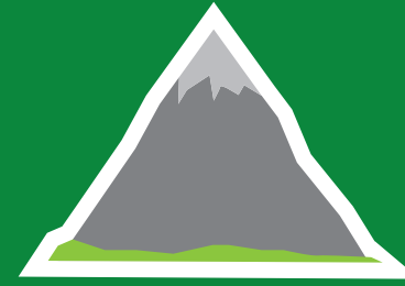
山 Shān (MOUNTAIN)