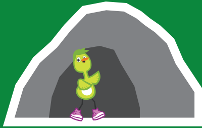
進入洞穴 Jìn Rù Dòng Xùe (ENTER THE CAVE)