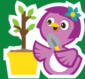
種 Zhòng (TO PLANT)