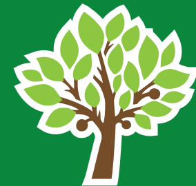
樹 Shù (TREE)