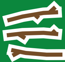
棍子 Gùn Zi (STICKS)