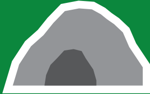
洞穴 Dòng Xùe (CAVE)