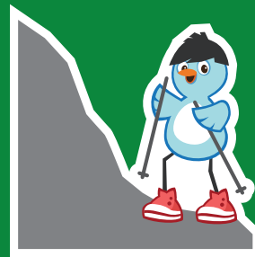
走上坡 Zǒu shàng pō (TO GO UP)