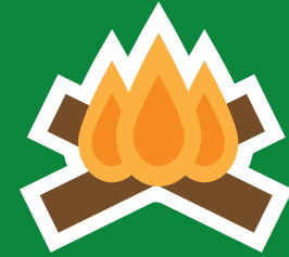
火 HUǒ (FIRE)