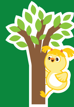
爬 Pá (TO CLIMB)