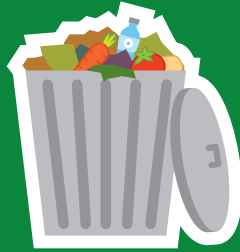
垃圾 LÈ SÈ (TRASH)