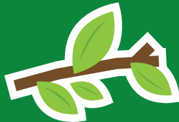
葉子 Yè Zi (LEAVES)